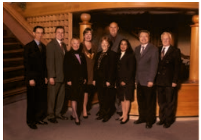
2002 Richmond Public Library Board